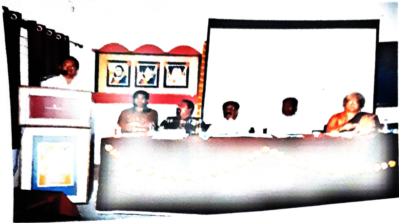
Resource person sharing views on AA