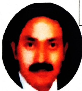
Key Note Address