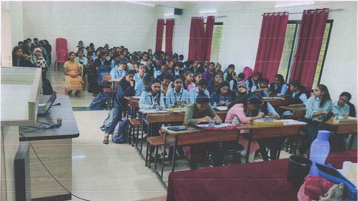
Students at workshop making Ganesh Idols with clay