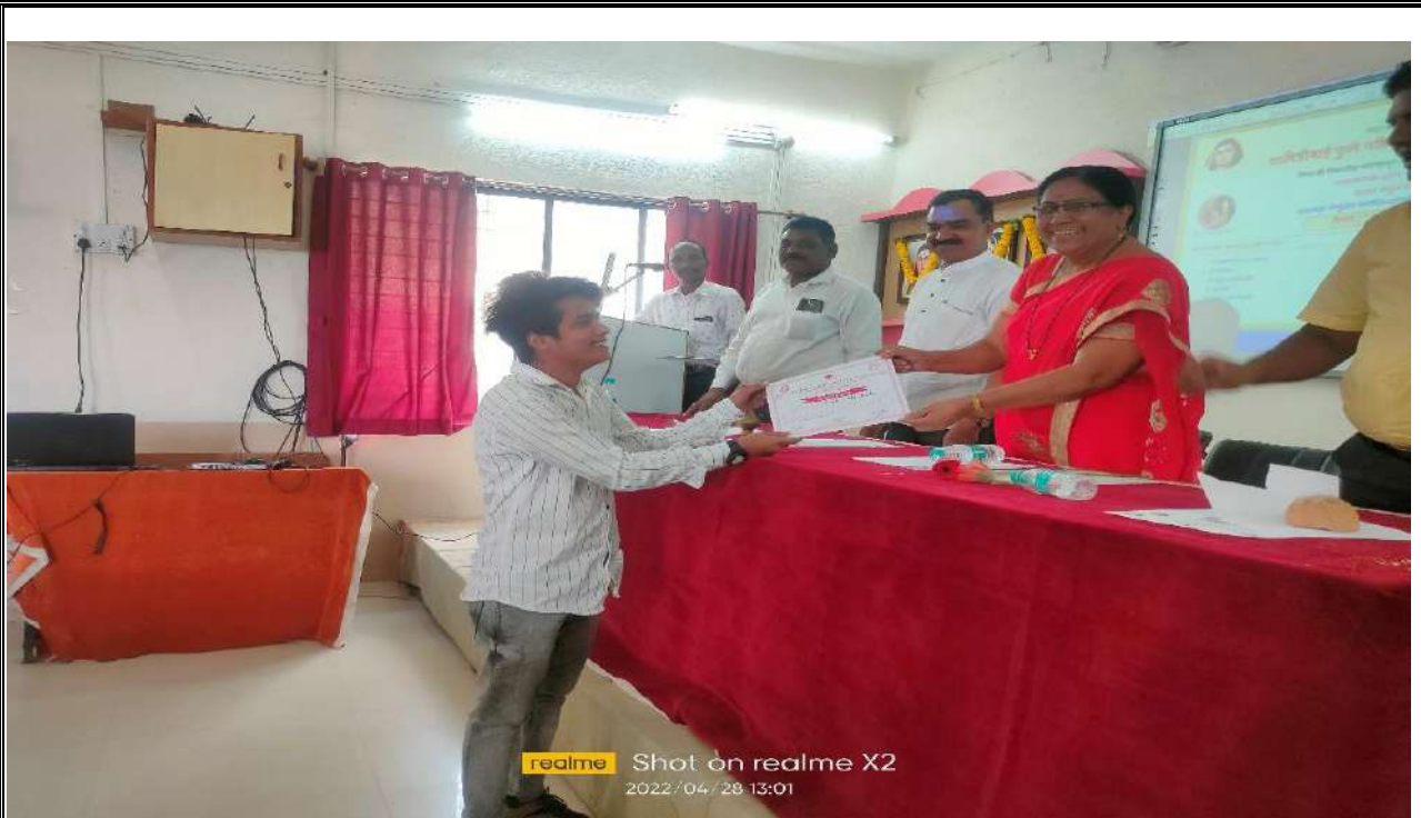
The students were given certificates for this workshop the guest