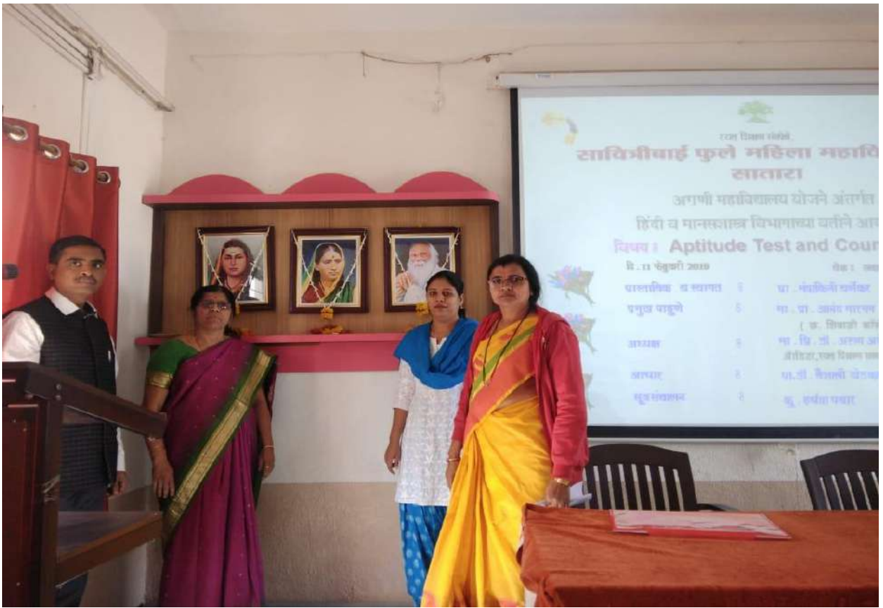
Workshop role play presentation