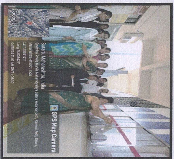
Inauguration of display articles by dignitaries