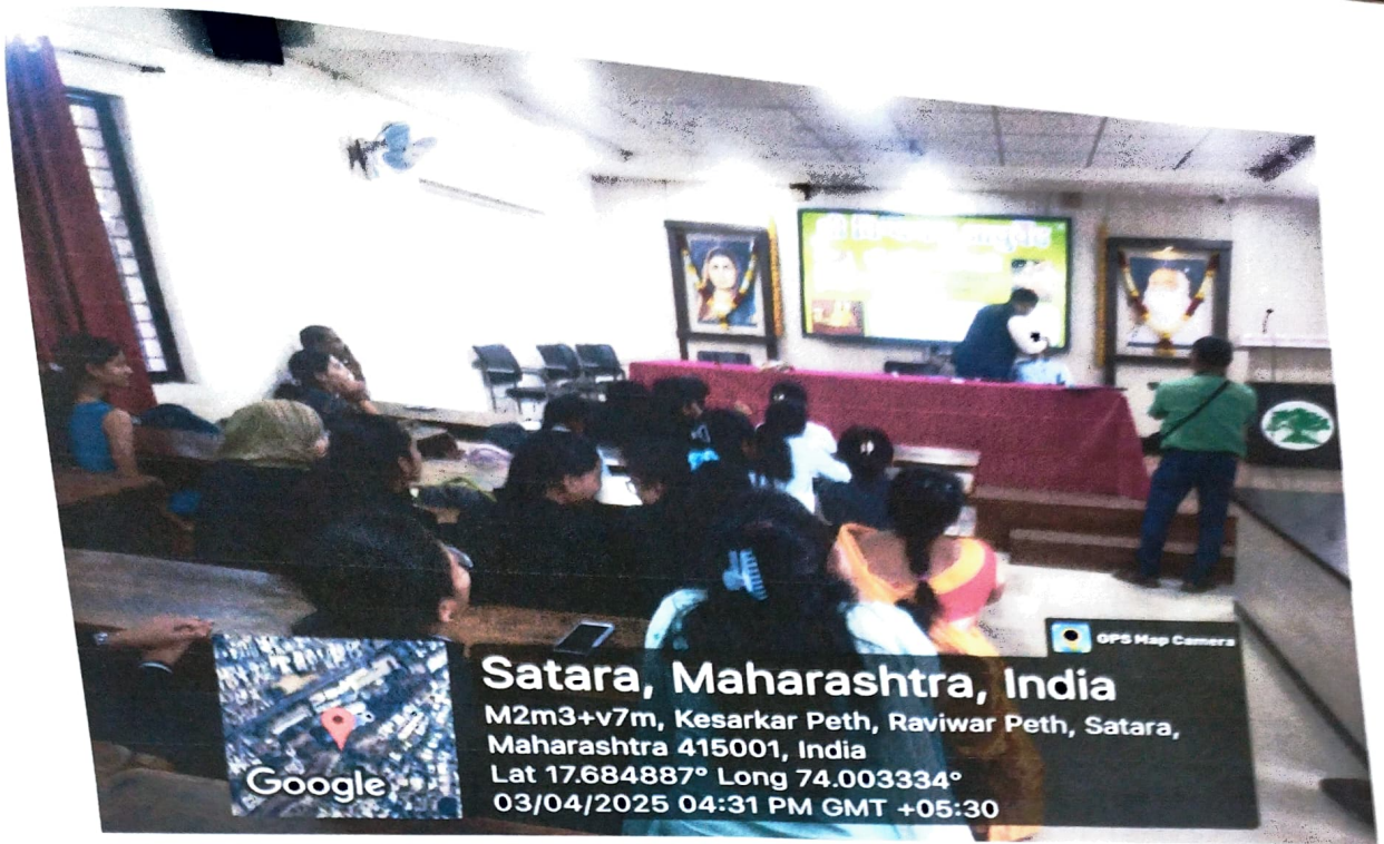
Actual demo of ayurvedik treatment on student suffering from migraine and sinus