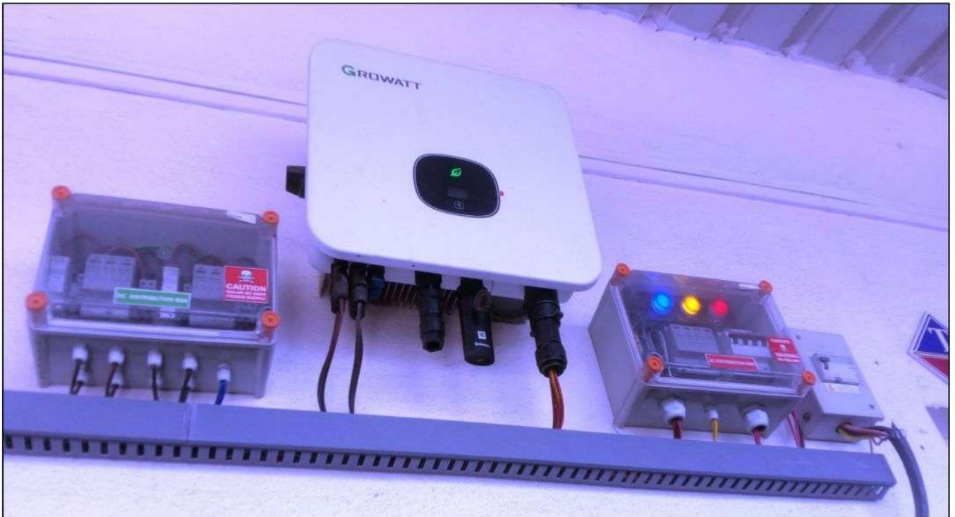
Solar power generation @SPMM