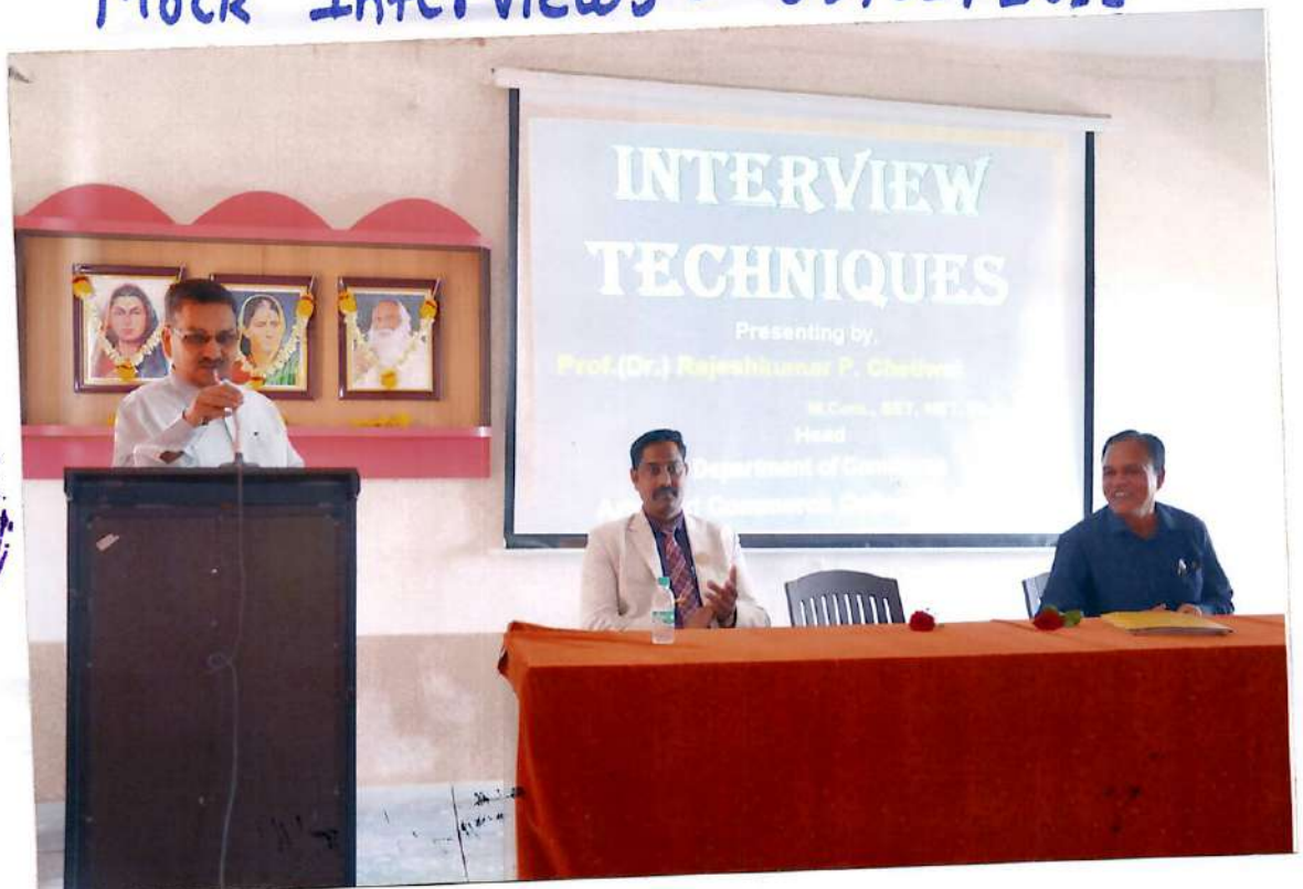
Interview Techniques Workshop