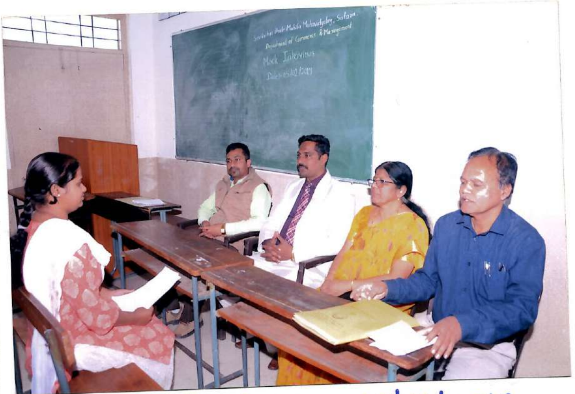
Mock Interviews - 05/02/2019