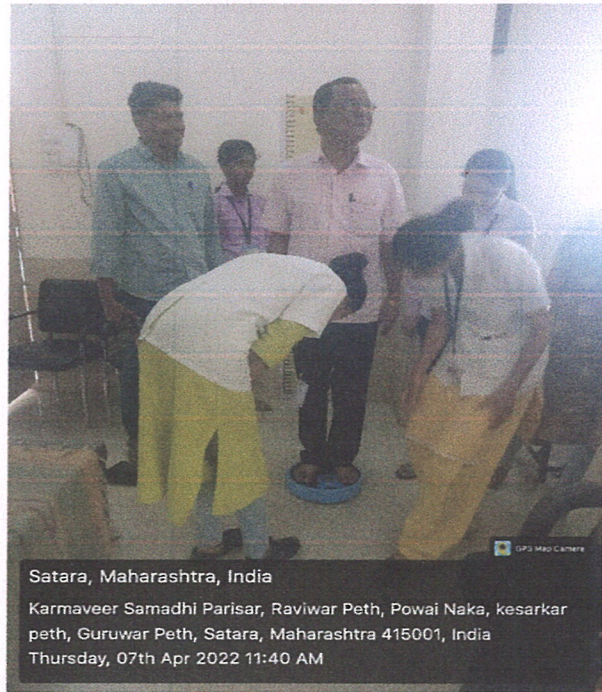
Satara, Maharashtra, India Karmaveer Samadhi Parisar, Raviwar Peth, Powai Naka, kesarkar peth, Guruwar Peth, Satara, Maharashtra 415001, India Thursday, 07th Apr 2022 11:40 AM