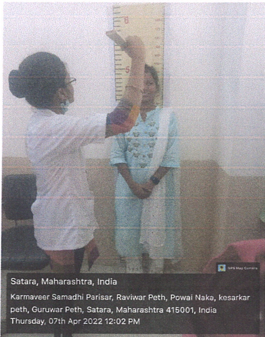
Satara, Maharashtra, India Karmaveer Samadhi Parisar, Raviwar Peth, Powai Naka, kesarkar peth, Guruwar Peth, Satara, Maharashtra 415001, India Thursday, 07th Apr 2022 12:02 PM